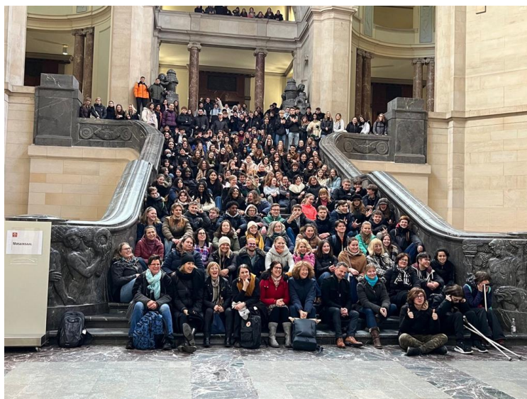
Participants from all countries at the City Council

Together with students from Germany, the Netherlands, Sweden, Spain, Poland and France, our grammar school students worked in 10 workshops in art, music, sports, culture, biology and social sciences. They could choose their field, as each workshop had a different task. One group documented the week and made a video, while another group discussed the pros and cons of living, studying and working in another country. In the art workshop, a collaborative artwork was created, and in the biology workshop, a bee house. One group also focused on water and water scarcity in different countries. Musical young people had the opportunity to work in a music workshop, forming a band and playing 3 popular songs in their own arrangement, while another workshop choreographed a dance. Young people had the opportunity to learn about and compare sports and to work in teams to learn about some of them. At the end of the project, the results were presented.