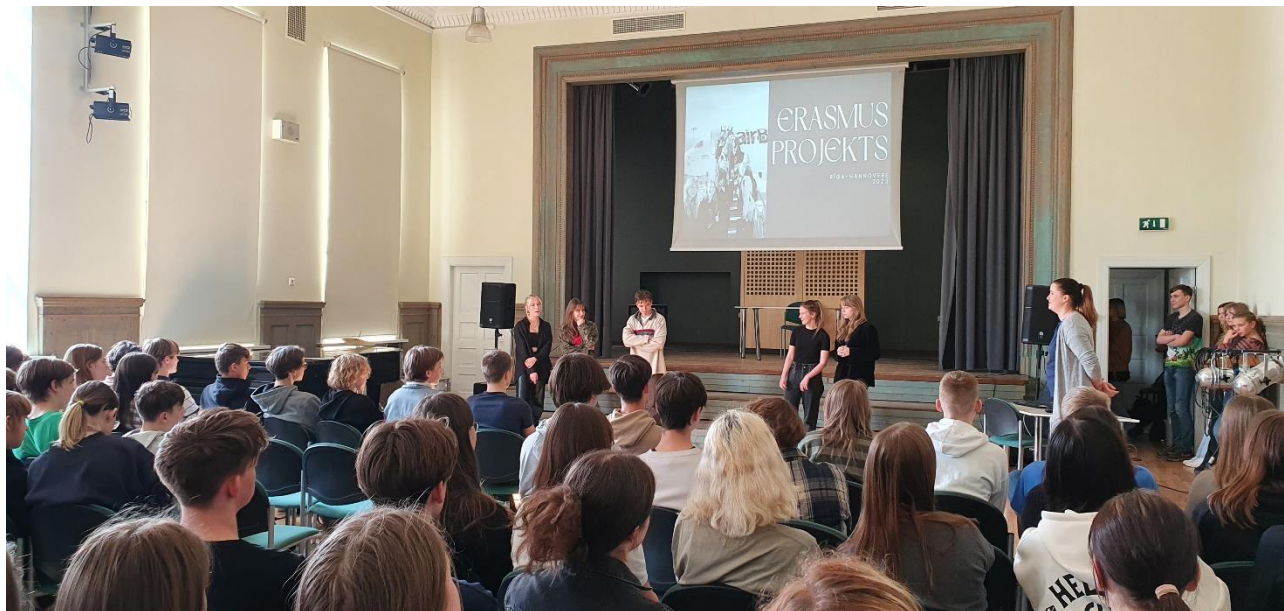
Students present the objectives and opportunities of the Erasmus+ project

Project participants share their experiences and talk about the project and its activities to 7th, 9th and 10th graders in the Grammar School's assembly hall. The students used a presentation and a video to visualise their story. The 8th grade group of the Xantene project also prepared a Kahoot to activate communication and broaden students' horizons.