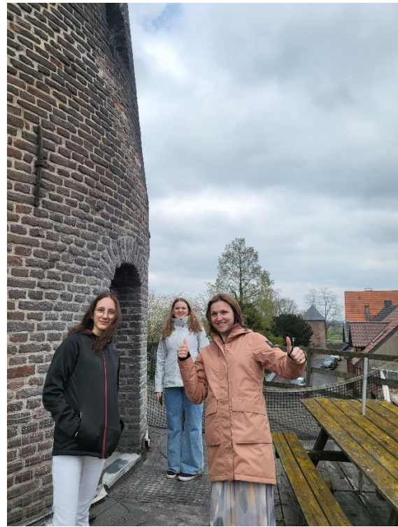
Up in the windmill