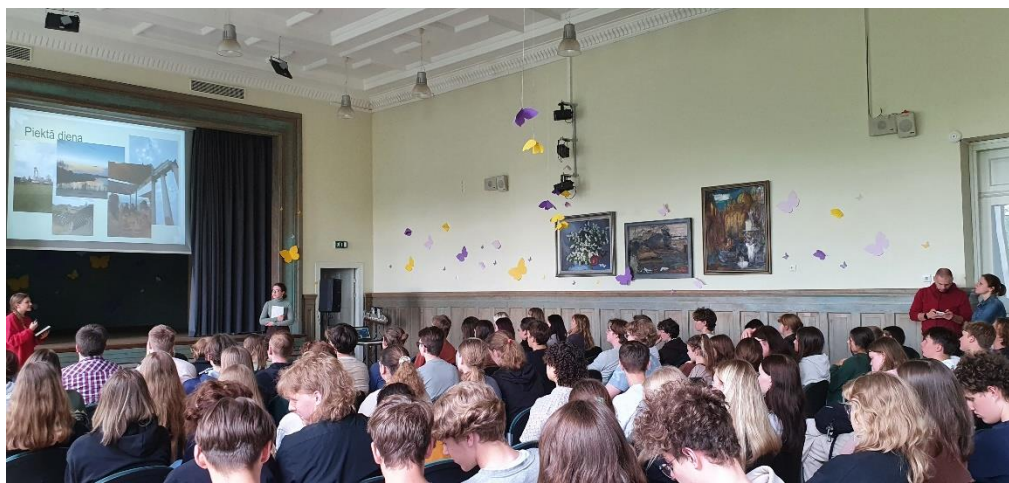
11th grade students talk about their experience at Xantene Gymnasium