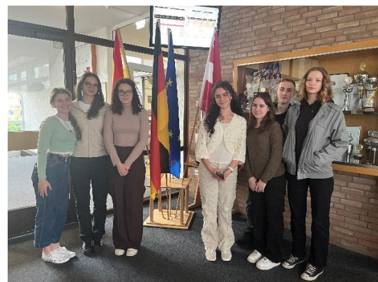
11 th grade student group