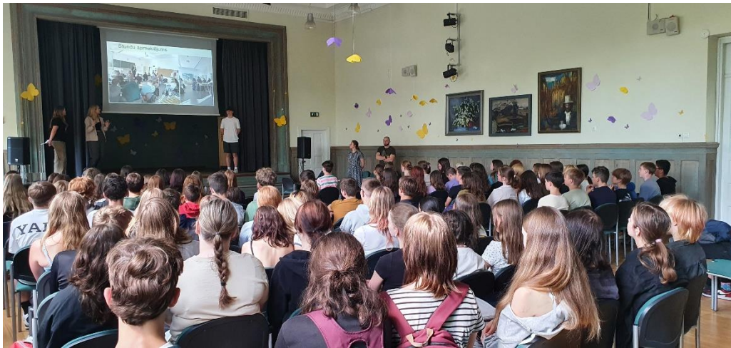
Xanten mobility participants talk about attending lessons