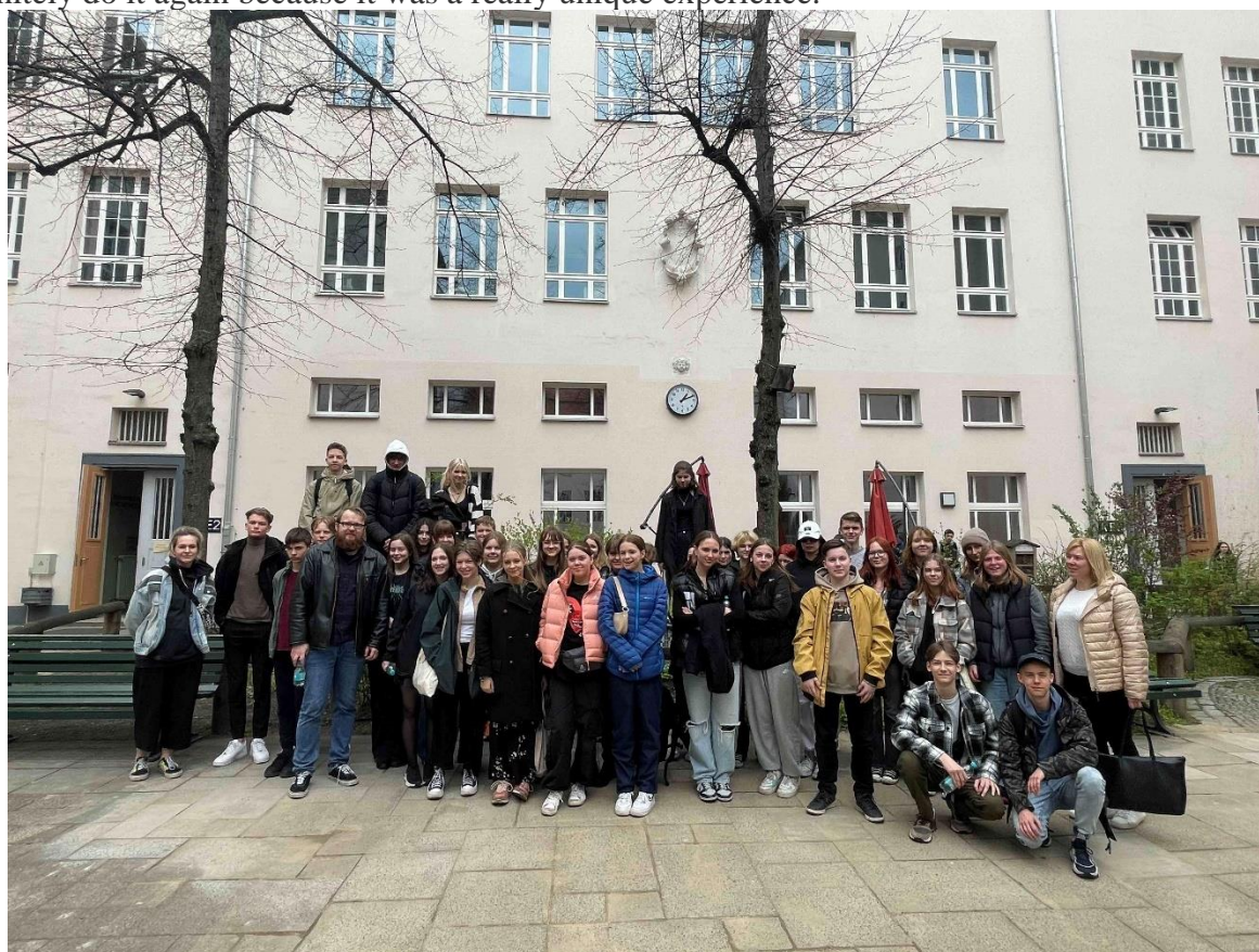
Group of students at the Berlin Lessing Gymnasium

The students confirm that the project has definitely provided them with valuable experiences, new friends and an insight into another culture, as one participant concludes: "When I signed up for this project, I did not expect to have gained so much when I came back. If it were possible, I would definitely do it again because it was a really unique experience."