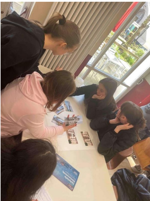
Work in groups