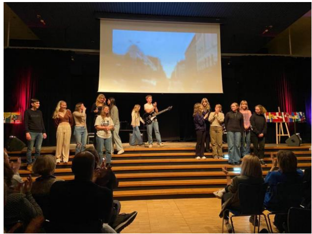
Presenting workshop results