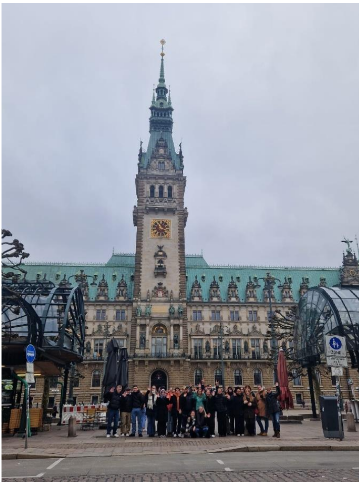
Student group in Hamburg