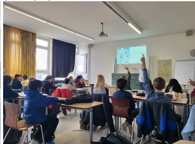
German language lesson