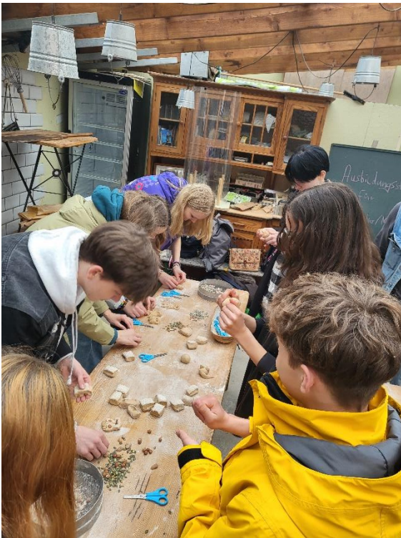
Learn bread baking skills in the bakery