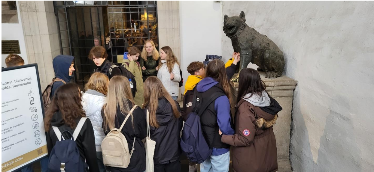
Students explore the pages of history by visiting Aachen, where they take a guided tour of the Aachen Cathedral and Archaeological Museum, as well as explore the Old Town.