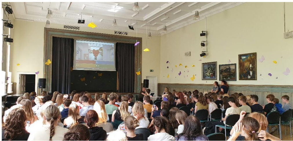
8th grade students engage the audience in a Kahoot game about what they heard