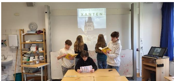
8 th grade students learn facts about Xanteni