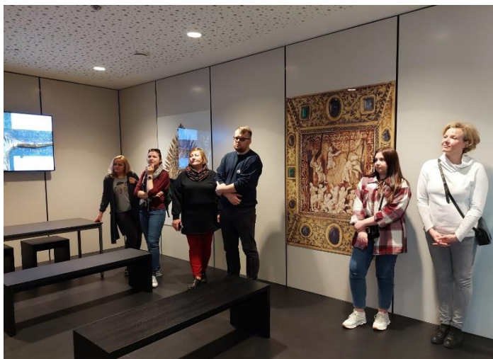
Mindene Dome Museum