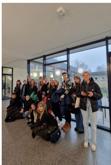
RVVG group of students