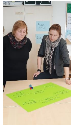
Exchange of experience with training managers