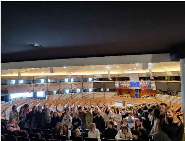
In the Chamber of Parliament