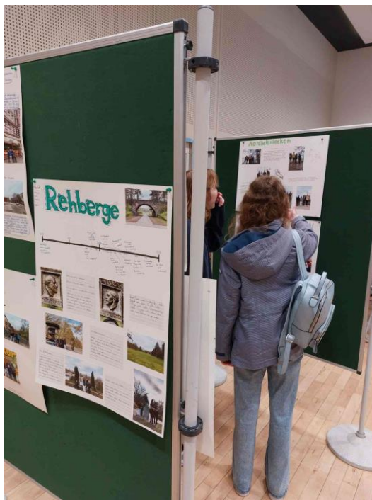
Results - posters about the attractions