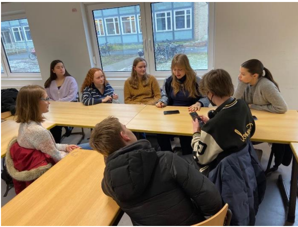
Work in groups