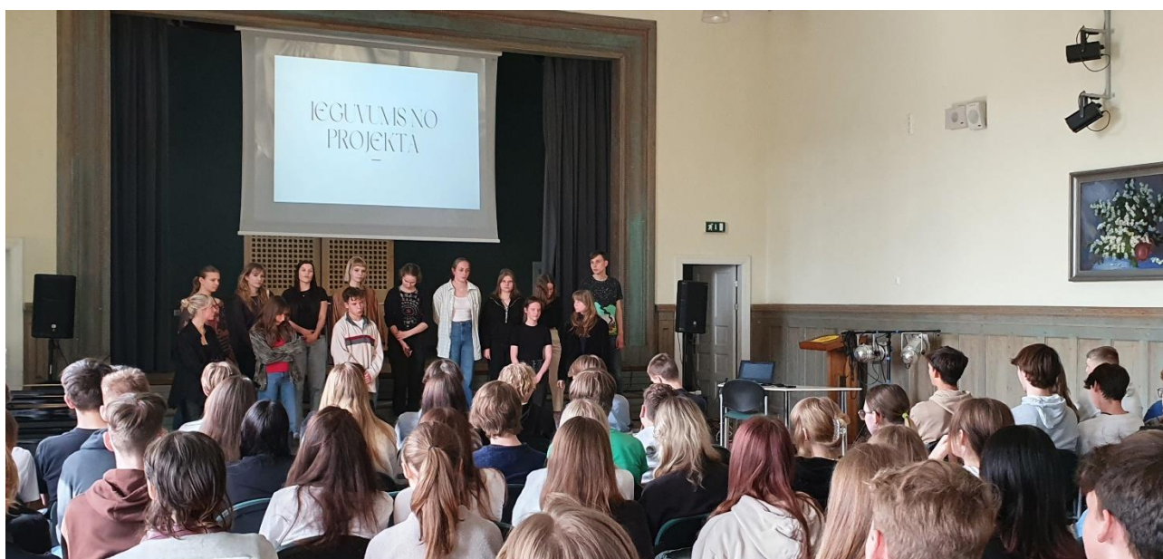
Participants of the Hanover mobility talk about the benefits of the project