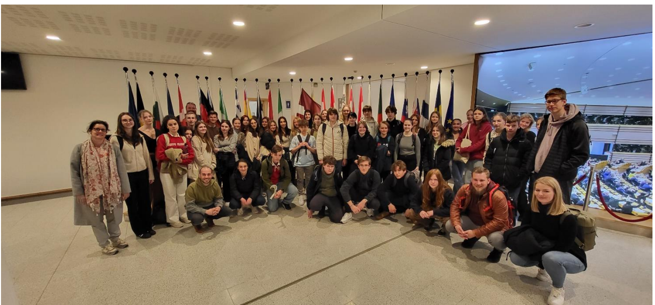
Student group at the European Parliament

"I had a great experience. Xanten is a small, lovely town with a legend about the hero Siegfried, which we learned more about at the Siegfried Museum. The most impressive experience for me was the trip to Brussels, where we were able to see the European Parliament and the Parliamentarium as part of the project. At the end of the project we had a discussion about Europe. It was very interesting and I tried to get involved as much as possible. I am very happy about this experience!"