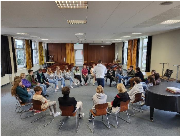
Study lesson - discussion

The benefits of the project included intercultural experiences, broadening of horizons, new friends made, as well as the development of foreign language, social and communication skills.