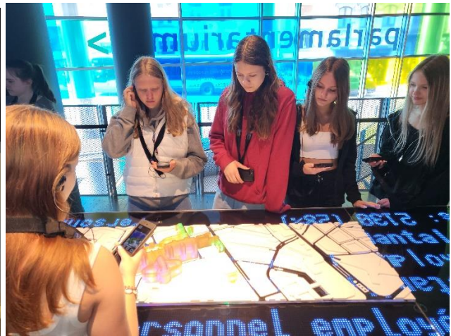
Educational activities in the Parliamentarium